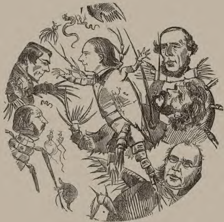
The depiction of contemporary politicians as the dreaded 'animalcula' was one of many satirical attacks on Yan Yean Water that appeared in Melbourne Punch.

The taps in workers cottages in the low lying areas like Collingwood and Burnley never ran dry. It's believed this caused the odd smile among the residents of Melbourne's more humble suburbs.