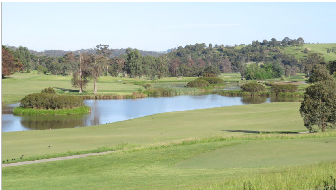
Yarra Upper Golf Club

The Yarra River (Upper) includes all tributary sub-catchments that discharge to the Yarra River above Warrandyte that are not the subject of another catchment specific water sharing plan.