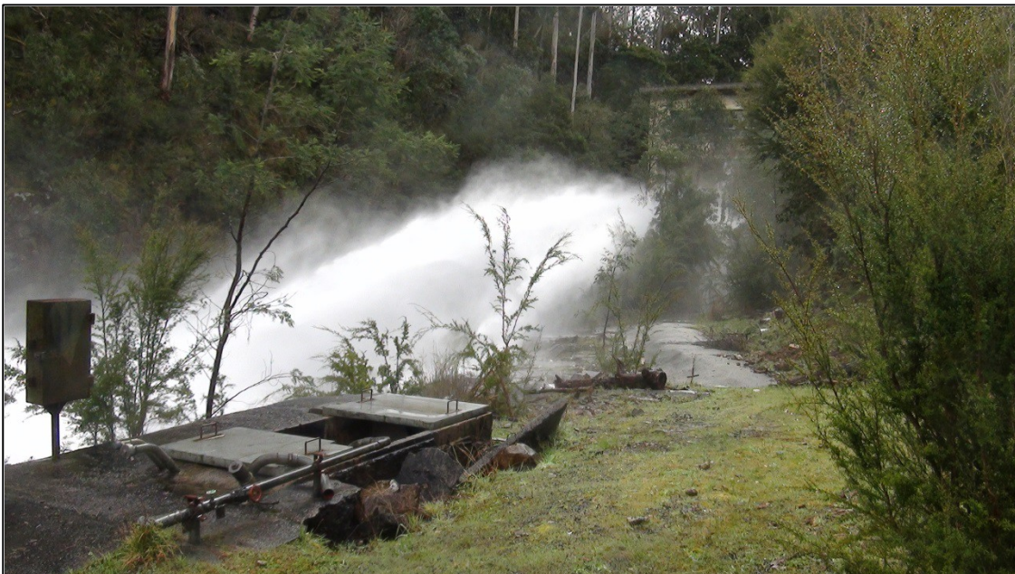
Upper Dam Environmental Flow Release