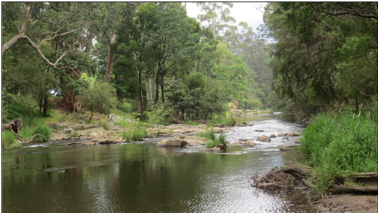
Yarra River (Upper) at Warburton