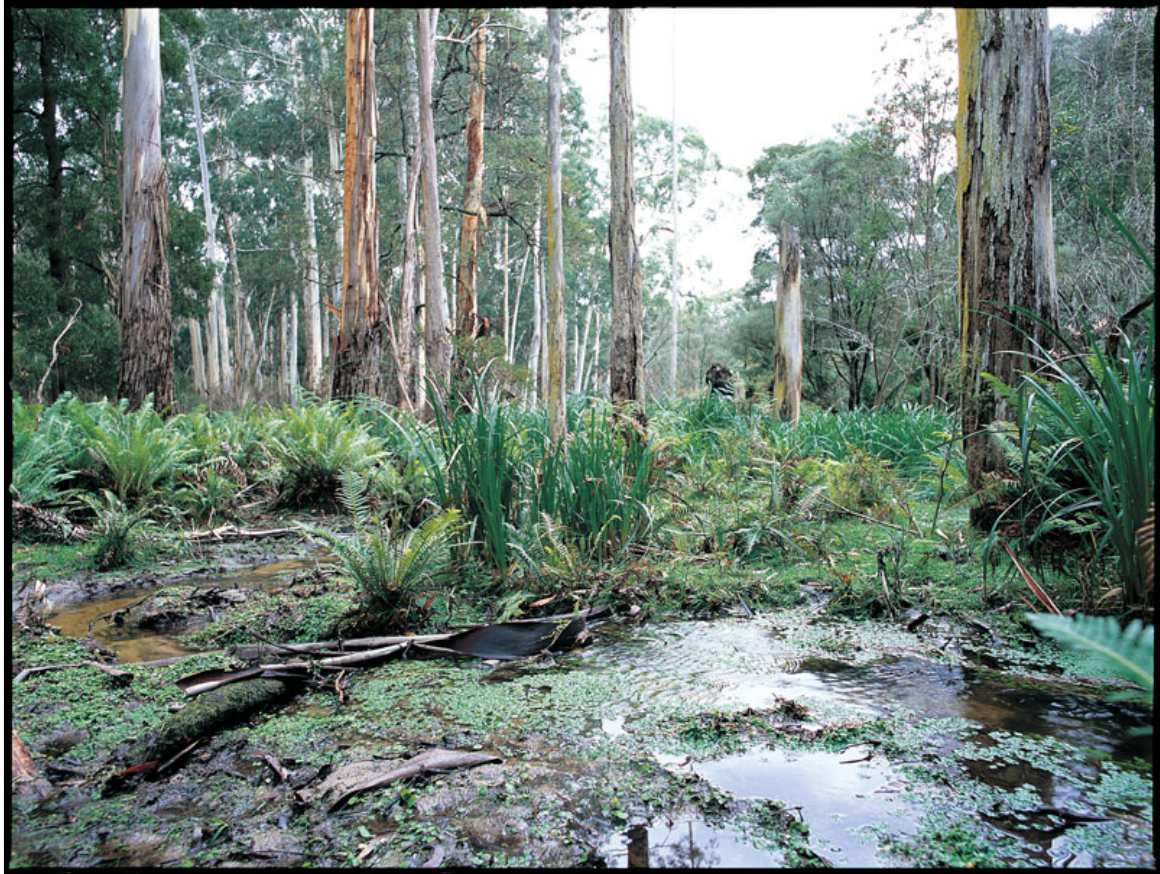
Plenty River at Headwaters