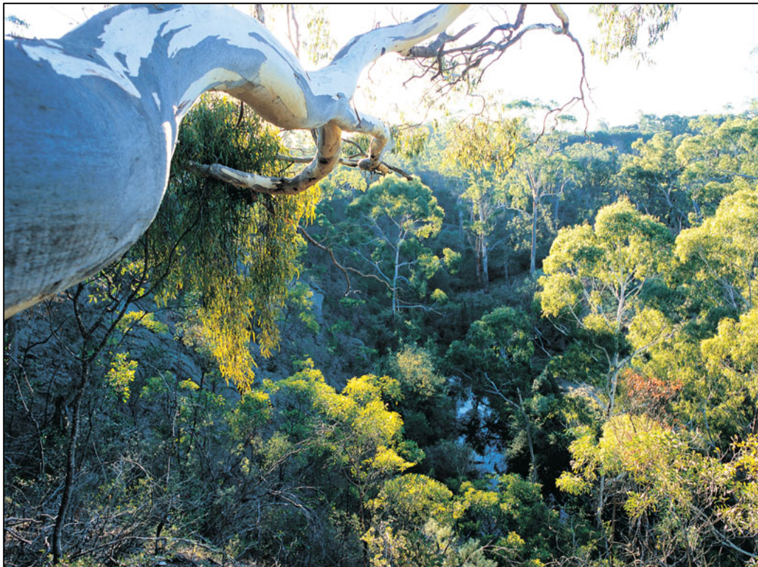
Plenty River Gorge

Bans are implemented or lifted when a catchment-specific trigger has been met, based upon the seven day rolling average stream flow.