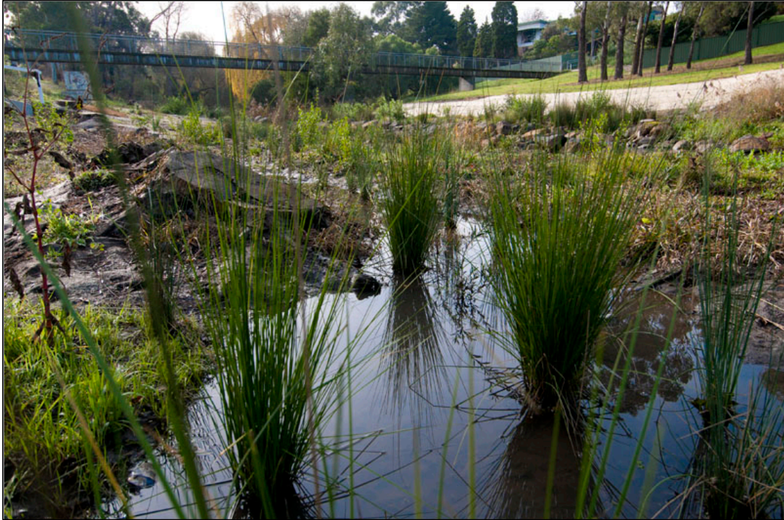
Merri Creek revegetation works

Active licence holders in the Merri Creek with allocations greater than 5ML are metered by Melbourne Water.