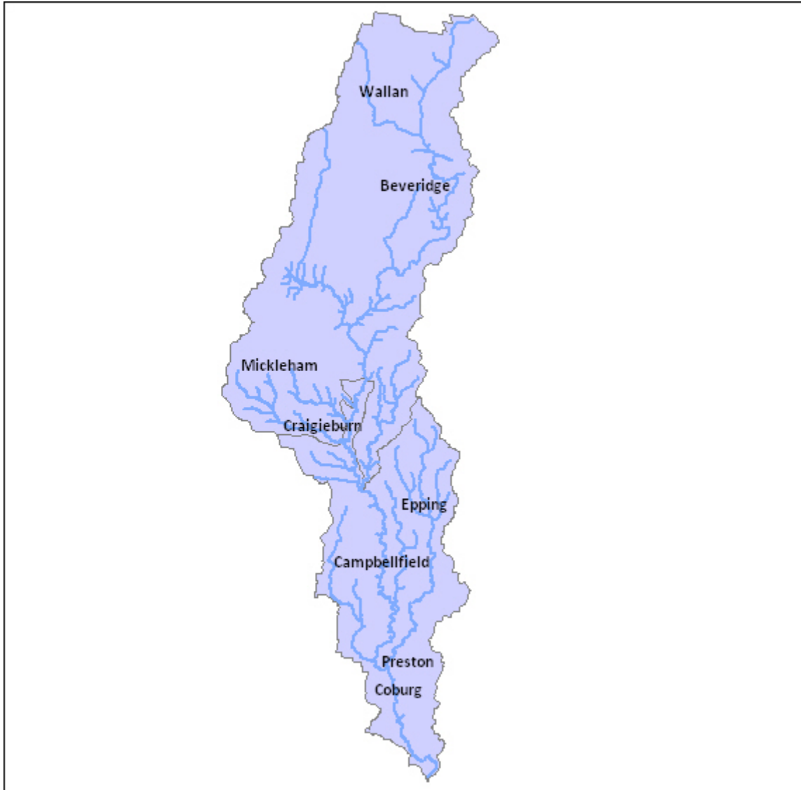
Merri Creek Catchment