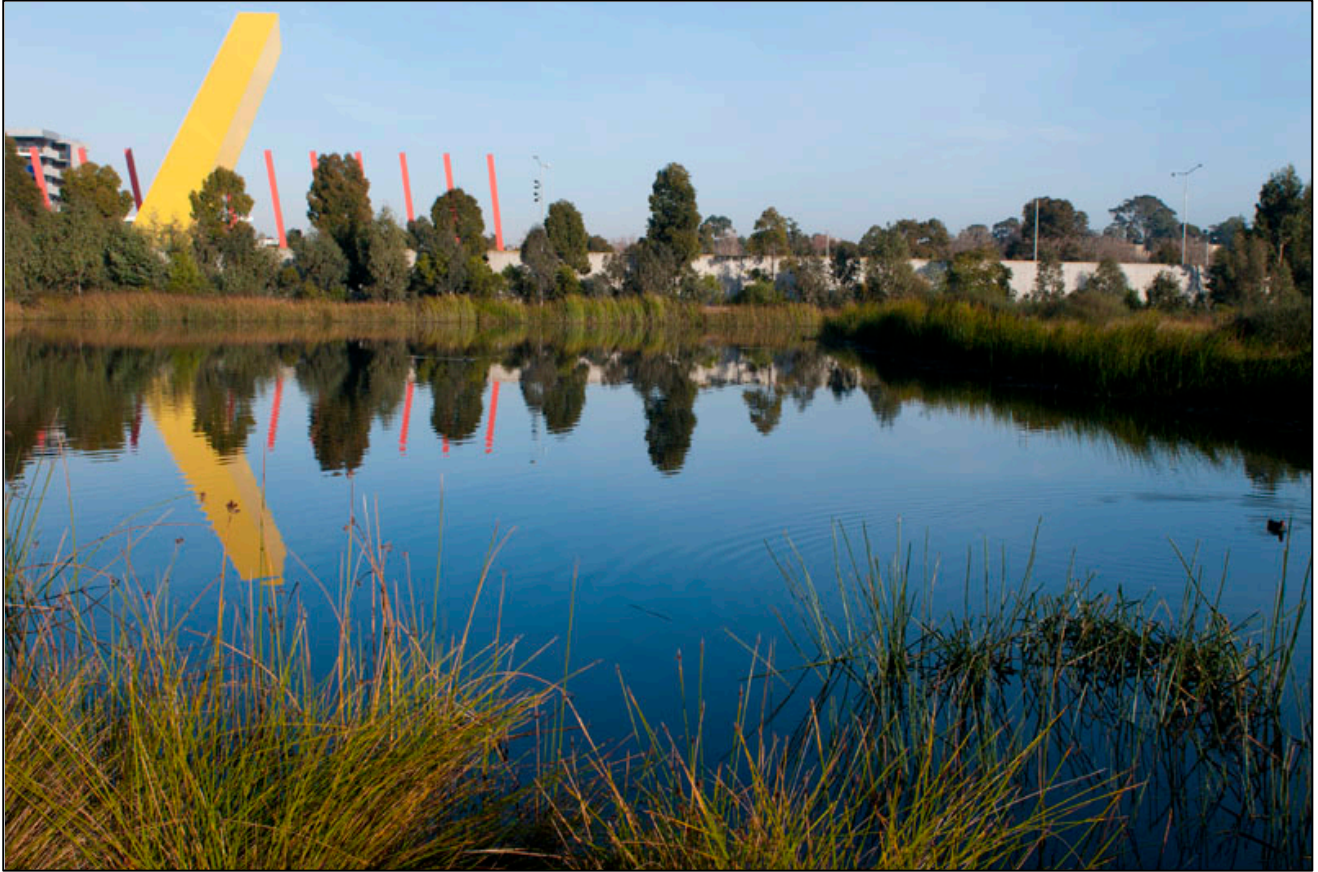
Royal Park Wetlands Irrigation Dam

Active licence holders in the Arundel and Moonee Ponds Creek with allocations greater than 5ML are metered by Melbourne Water.