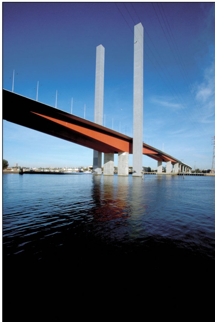
Moonee Ponds Creek near Bolte Bridge

Bans are implemented or lifted when a catchment-specific trigger has been met, based on an instantaneous stream flow. Diverting can only resume when the 3 day average is greater than 4.0 ML.