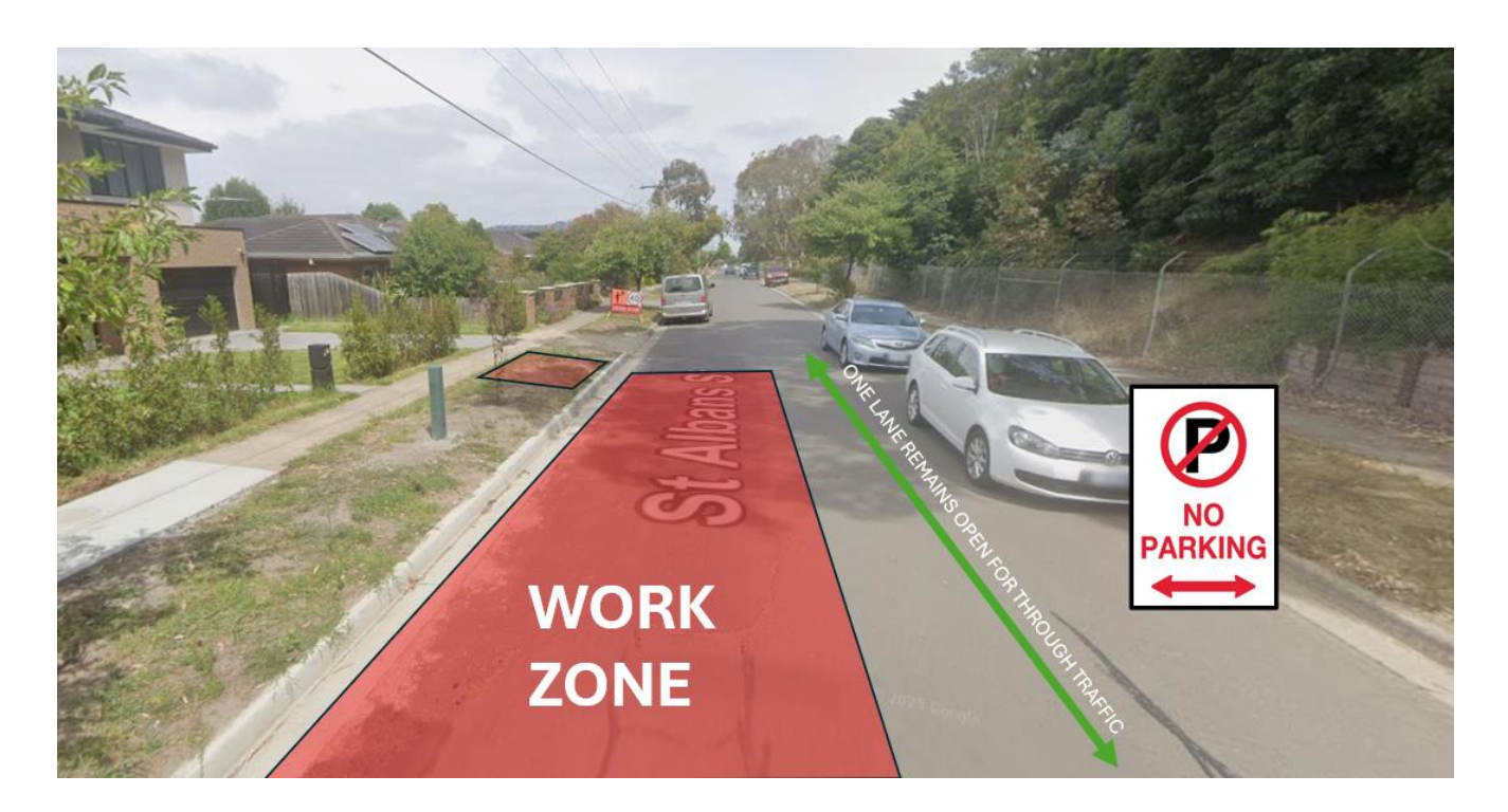
Image 1: Work zone in front of 60 St Albans Street, Mount Waverley