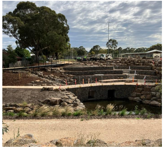
Major works on the pond and terracing area

From mid-January 2025, we'll be starting to pack up the site sheds and heavy machinery, and restoring areas affected by our works. There are some other minor activities we need to complete between January and March 2025, such as the installation of public safety fencing in the ponding and terracing area, line markings on shared paths, landscaping, and reinstatement of fencing around the oval.