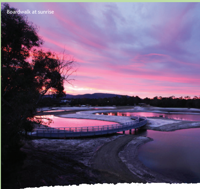
Boardwalk at sunrise

In Melbourne, our waterways and land are essential for our native wildlife and to our way of life. We've got some exciting news - The Reimagining Blind Creek and Lewis Park project is now complete and ready for you to enjoy!