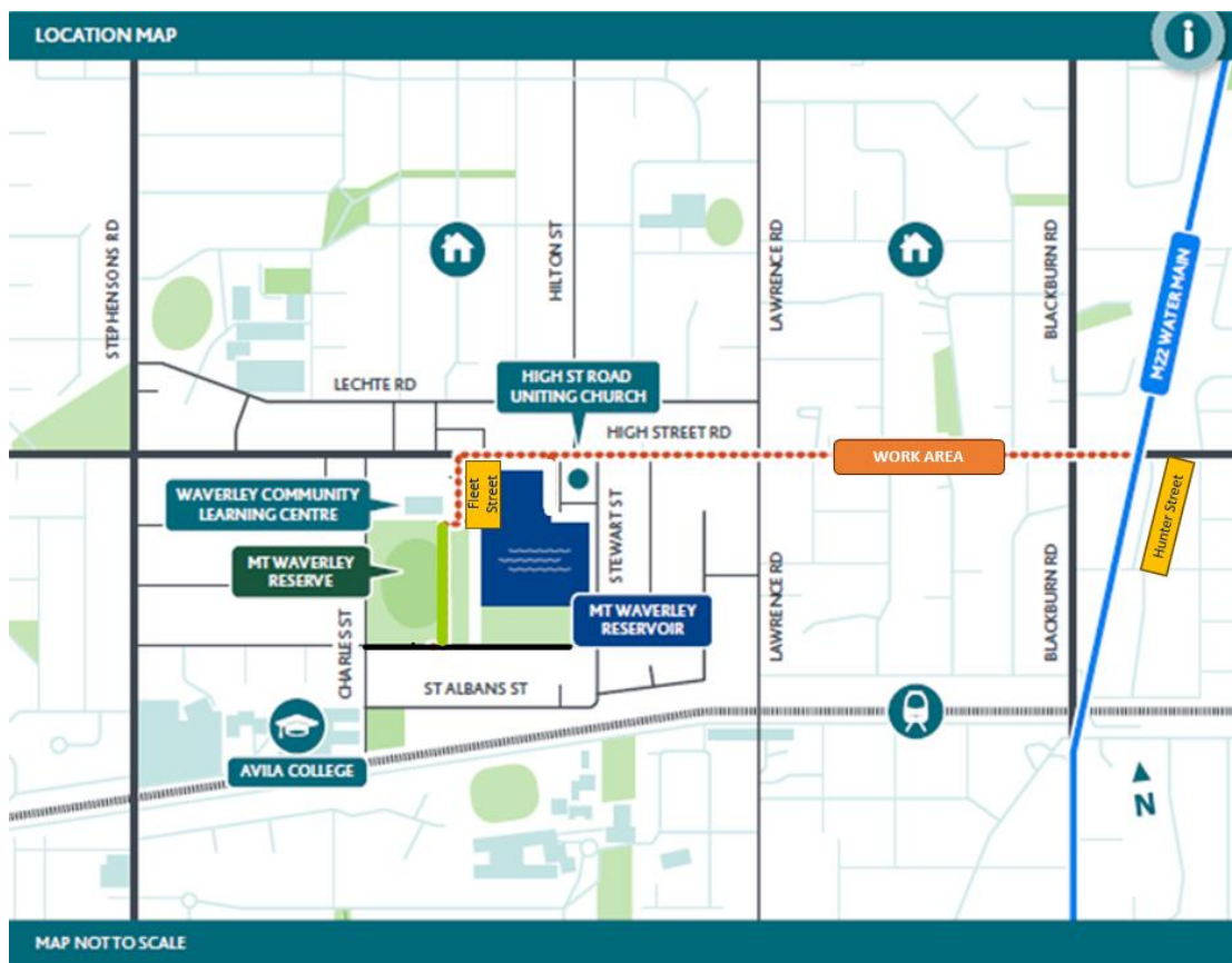
Figure 1: Work area – High Street Road between Fleet Street and Hunter Street