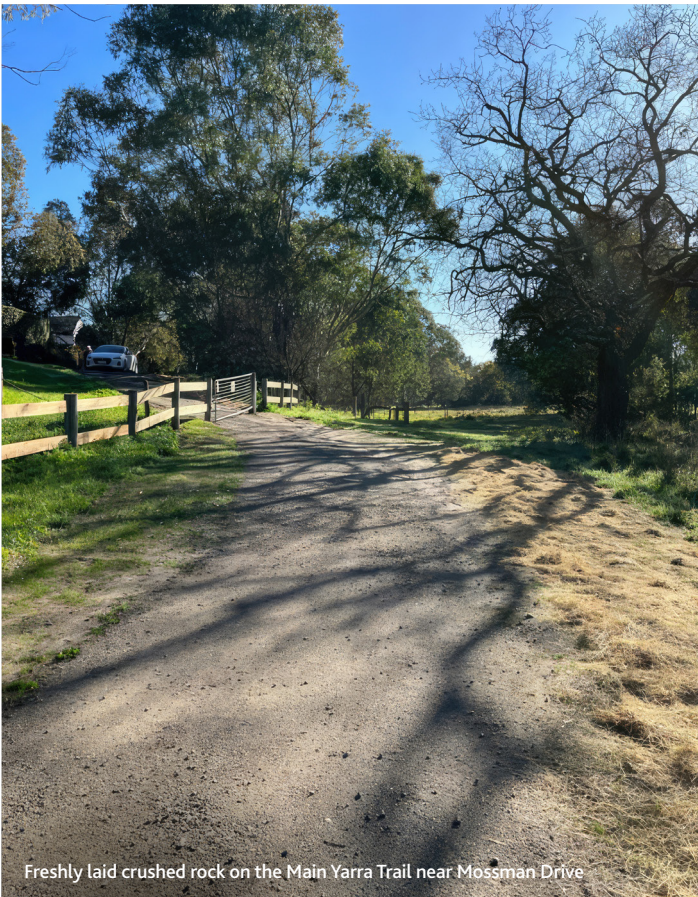
Freshly laid crushed rock on the Main Yarra Trail near Mossman Drive