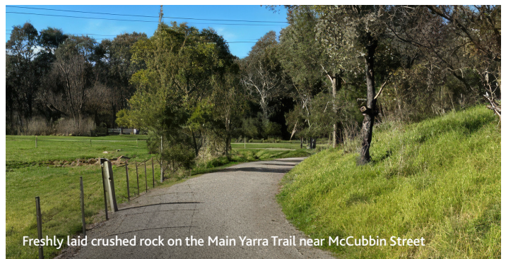
Freshly laid crushed rock on the Main Yarra Trail near McCubbin Street