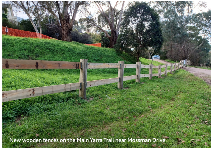
New wooden fences on the Main Yarra Trail near Mossman Drive