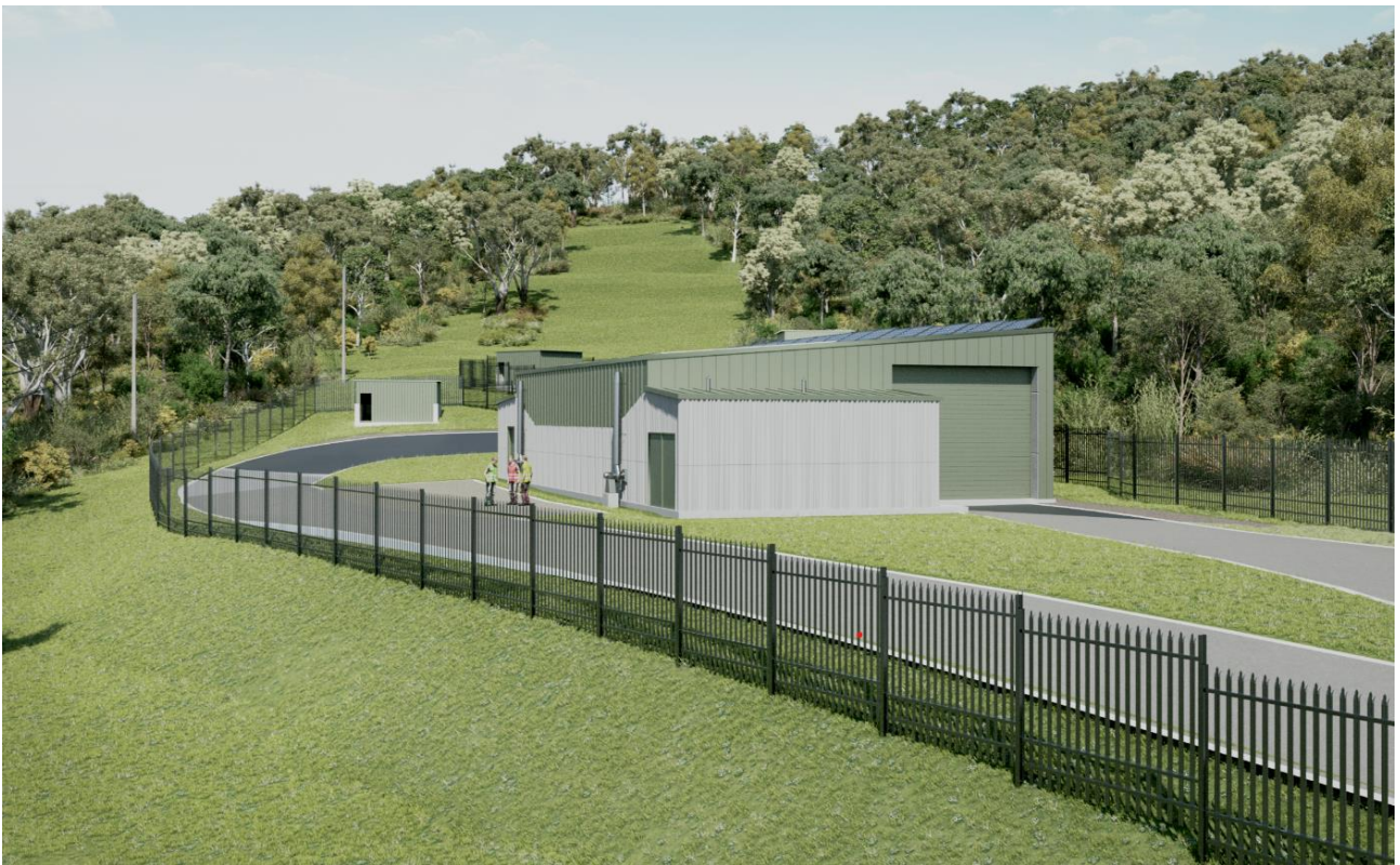
Mount Evelyn Water Treatment Plant Visualisation (image September 2024)

To continue our vital work in safeguarding Melbourne's water supply, Melbourne Water will soon commence works to construct a new back-up water treatment plant in Mount Evelyn. The new treatment plant, built within the Tramway Track Pipe Reserve, will prepare us for the future and provide greater water security for today, tomorrow and for generations to come.