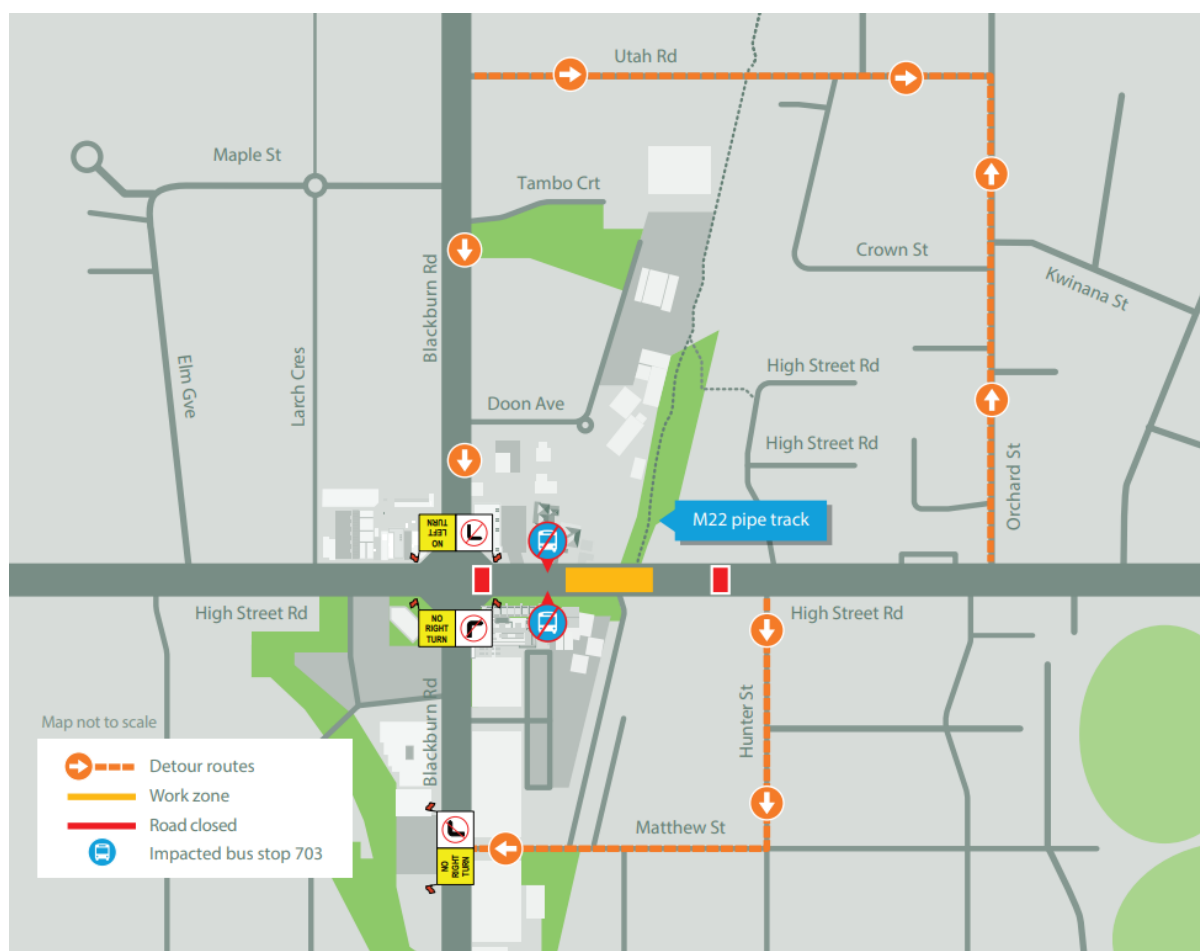
Figure 1: Work area and local traffic detour routes