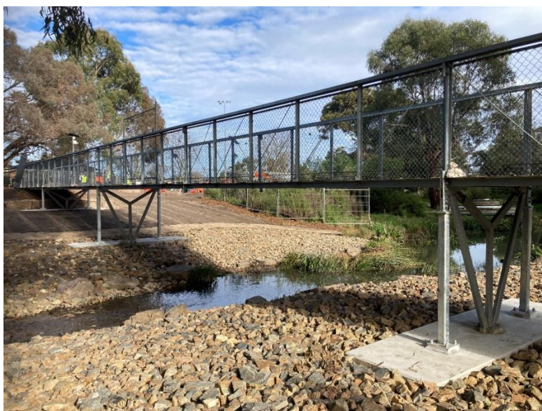
Looking south west along the footbridge at Fairpark Reserve