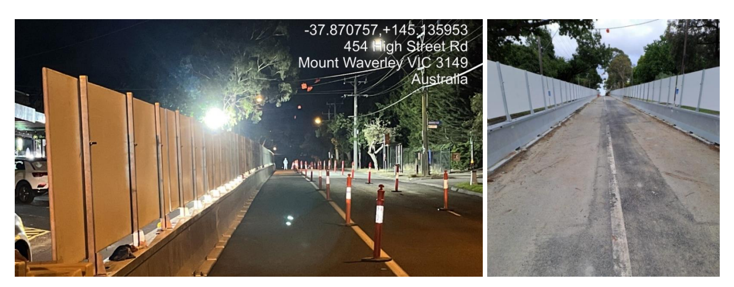
Figure 2-3: Barrier install works at night and barriers on High Street Road

To ensure the safety of commuters, bus stops within the work site area will close until it is safe to re-open. Please use neighbouring bus stops during this time.