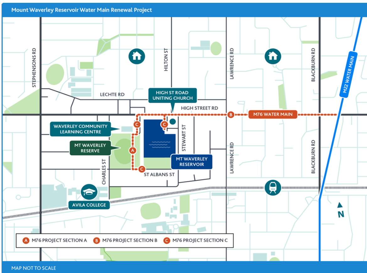
Figure 1: Project area map and work sections

Renewal of the water main will ensure the supply of safe and reliable water now and into the future for our customers and the wider community.