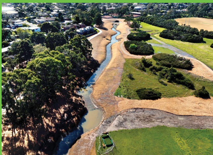
Aerial view of Blind Creek, new shared paths and revegetation