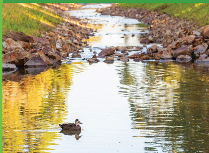
Ducks enjoy their new home