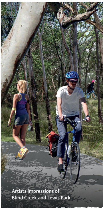
Artists impressions of Blind Creek and Lewis Park