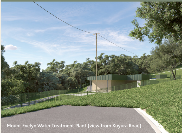
Mount Evelyn Water Treatment Plant (view from Kuyura Road)

The Mount Evelyn Water Treatment Plant will be a main building with some smaller buildings that disinfects water from the Silvan Reservoir turning it into clean, quality drinking water for the population. An access track from Tramway Road to the new building will also be constructed.