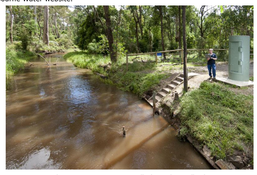
Flow Gauge Site on Woori Yallock Creek at Yellingbo

Streamflow Management Plan and Local Management Rules information will be sent to all affected licence holders within a catchment and copies can be obtained from the Melbourne Water website.